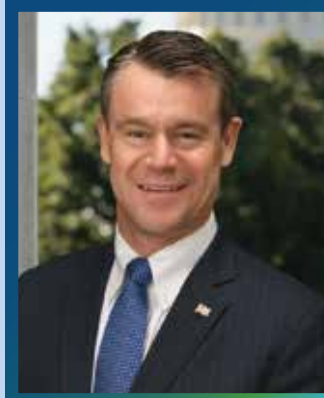
Todd Young Senator United States Congress Indiana