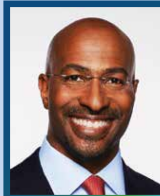
Van Jones President The Dream Corps California