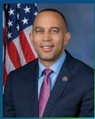
Hakeem Jeffries House Minority Leader United States Congress New York