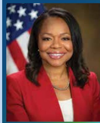
Kristen Clarke Assistant Attorney General U.S. Department of Justice Washington, D.C.