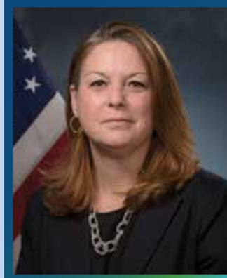
Kimberly Cheatle Director U.S. Secret Service Virginia